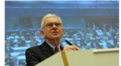
Hans-Gert Röttering, President of the European Parliament