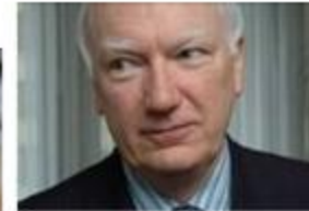
Philippe Maystadt, President of the European Investment Bank