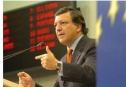
José Manuel Barroso, President of the European Commission