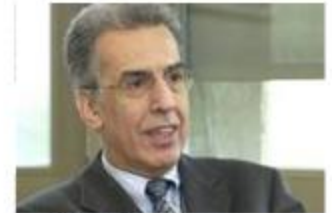
Nikiforos Diamandouros, European Ombudsman