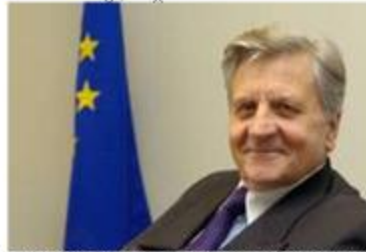
Jean-Claude Trichet, President of the European Central Bank