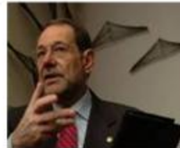
Javier Solana, Secretary-General of the Council of the European Union, High Representative for Common Foreign and Security Policy